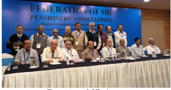
The new team of Office-bearers

The Deputy General Secretaries for Mumbai-Maharastra and Amaravati are kept vacant pending formation of new affiliates.