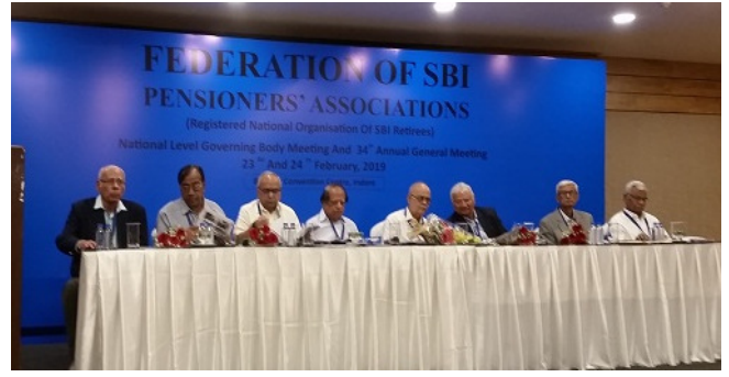
The Meeting in session

The Annual General Meeting held on 24<sup>th</sup> February discussed in detail on all issues including inordinate delay suffered in reimbursement of bills submitted to the Insurance Company, non availability of subsidy in respect of unbearable premium amount especially for Family Pensioners, augmentation of Legal Fund, shortcomings in the reintroduced REMBS, etc. It was reported that there is no much enrolment in the New REMBS.