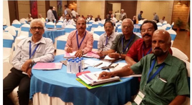
Representatives of SBIPAK at the Meeting

of the pioneer Bank of our country. He specially expressed his heartfelt thanks to the organisers for giving him the opportunity to participate and address the august audience. He explained, in detail, about the unprecedented changes that are being brought into the Banking function to transform it to the Digital Banking. He also added that the services of many of our retired officers are now being utilised by the Bank in different areas. He referred about Bank's recent initiative "Navi Dishaye" and the commendable participation by retired officers in successfully conducting the training programmes. He concluded his inaugural address saying that the present stature of the Bank, no doubt, could be achieved only because of the dedicated services rendered by the elders and seniors of SBI family.